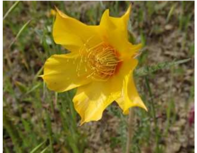
Blazing star ( Mentzelia lindleyi) at Sierra Vista Open Space Preserve, April 2020

Our Chapter emails announcements about upcoming events (talks, hikes, sales, wildflower show, garden tour), alerts, last-minute notices and late-breaking news. To subscribe to this list, please send an e-mail to: cnps-scv-news+subscribe@googlegroups.com .