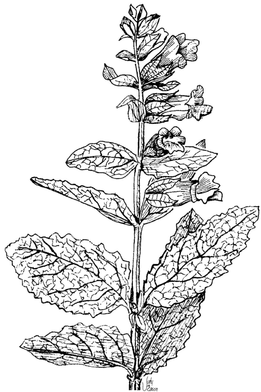
PITCHER SAGE Lepechinia calycina

We love having the nursery at Hidden Villa and the butterflies and birds love our plants.